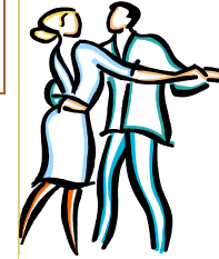
Dancing is great fun and exercise!

dance the night away. In Sept., we boogied at Stoney's, Oct. was the Fontana Lounge, and this month we'll be danc-